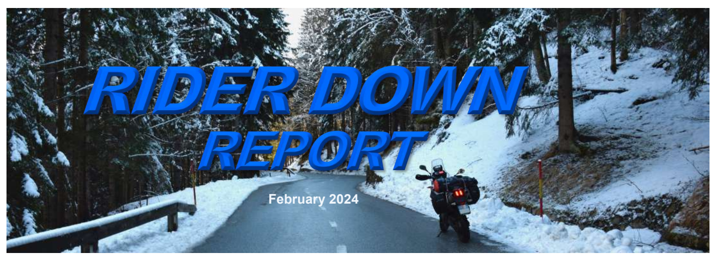
Rider Down is a monthly update of motorcycle crashes that occurred throughout the U.S. Navy and Marine Corps. The data in this publication reflects what was reported during the time period covered.