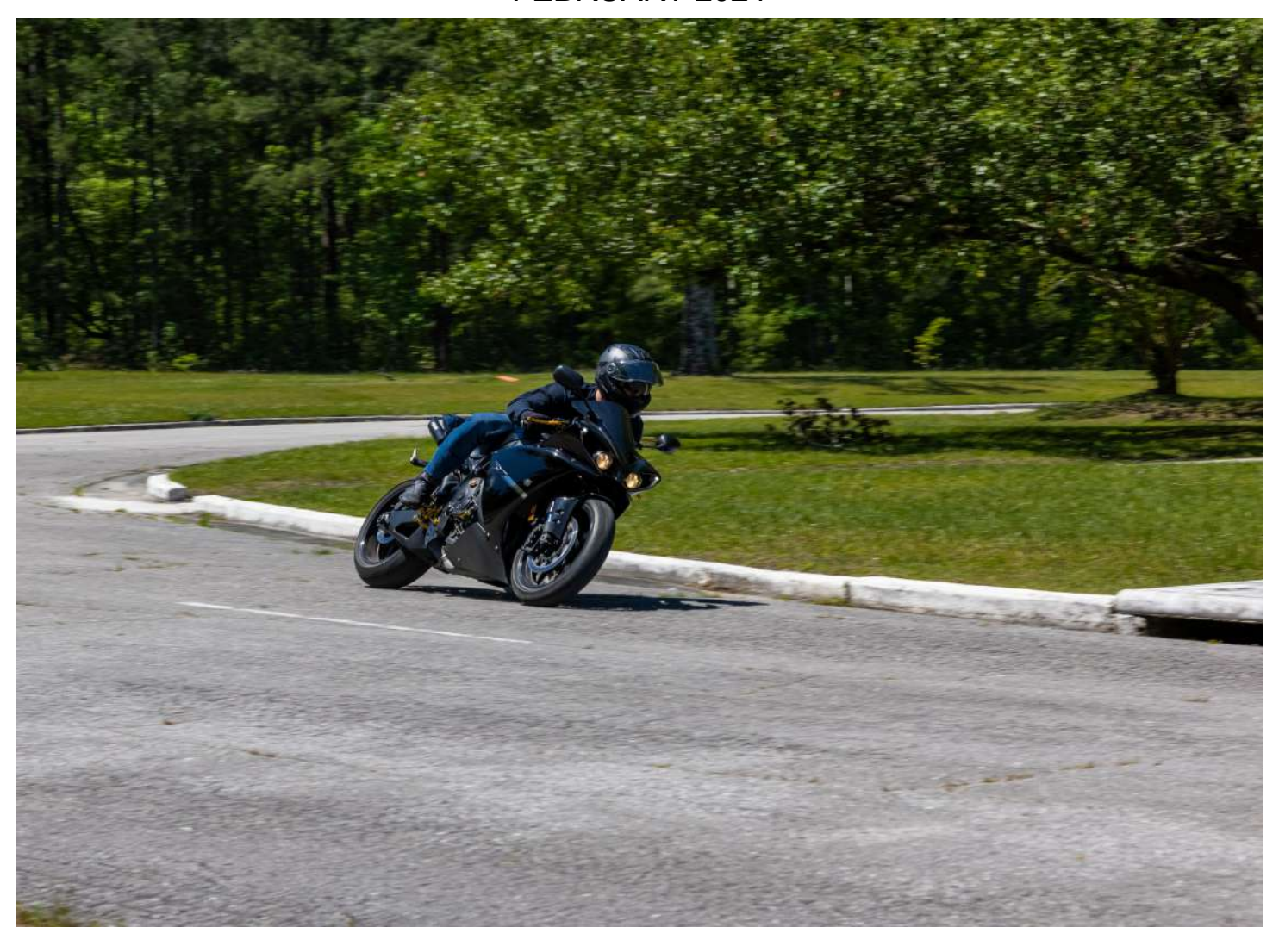
A U.S. Marine with 2d Marine Division turns a corner during a Motorcycle Awareness event on Camp Lejeune, North Carolina, April 21, 2023. The event allowed Marines from 2d MARDIV to practice motorcycle safety with fellow riders in a controlled environment.