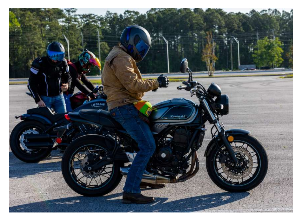
U.S. Marines with 2d Marine Division (MARDIV) participate in a Motorcycle Awareness event on Camp Lejeune, North Carolina, April 21, 2023. The Motorcycle Awareness event allowed Marines from 2d MARDIV to practice motorcycle safety with fellow riders in a controlled environment.

Additional Rider Down reports are available here: https://navalsafetycommand.navy.mil/Resource Motorcycle-Rider-Down-Reports-Newsletters/.